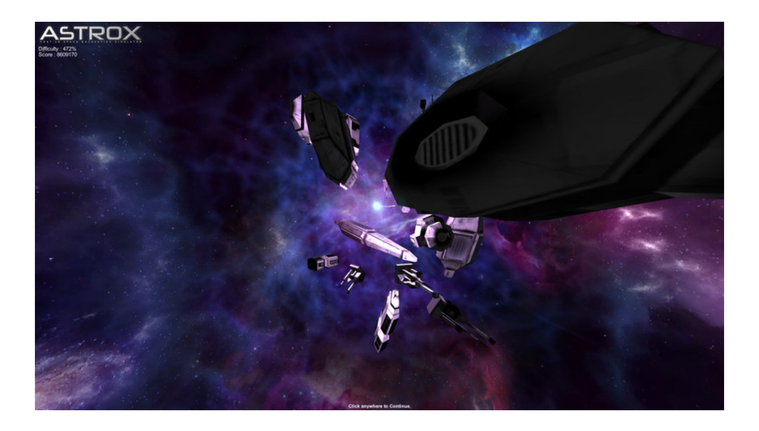
Download ->>->> http://bit.lv/2JYOUSt

Astrox: Hostile Space Excavation Free Download [Xforce]